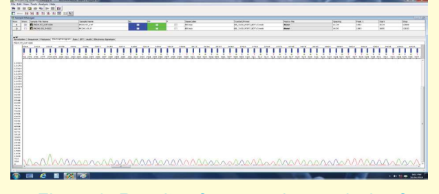
Figure 2. Results of sequencing analysis of HVII region - Mitochondrial DNA by software sequencing analysis software 6.

- The region between positions 73 and 340 in HVII were completely sequenced, analyzed.